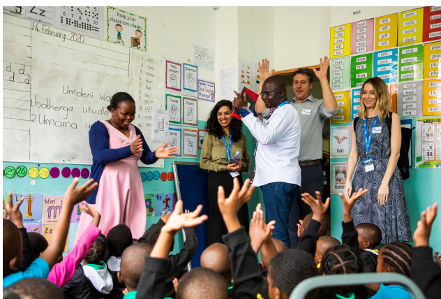
Participants interacting with students at Streetlight Schools

Hosted by our Johannesburg-based members, SPARK and Streetlight School, the visits allowed members