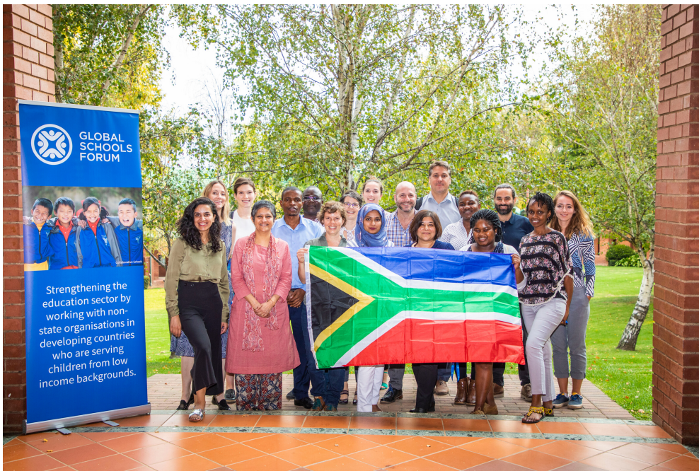
Participants at the GSF Spotlight, February 2020

"Hands down the most useful conference I've ever attended. I had time to think about important organisational topics/issues that always seem to be pushed down the "to do" list. Being surrounded by such smart and thoughtful individuals was really great. They challenged my thinking process in a manner that I really appreciate. So cool to be a part of this important global group. I feel like I'm part of something much bigger. That's a good feeling." - GSF Member